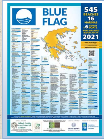
Blue Flag Poster