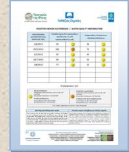
Information about bathing water quality