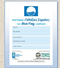
The poster with the name of the beach, the beach manager name and his telephone