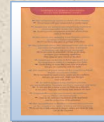
Information for safe swimming