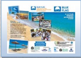
Blue Flag Brochure