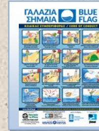
Code of Conduct